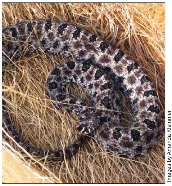
Collinsorum 1(1) April 2012