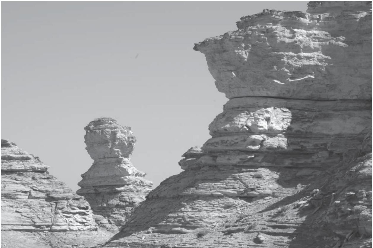
Rugged topography characterized the habitat of amphibians, turtles, and reptiles typically encountered during this KHS spring field trip to Logan County, Kansas, on 1–2 May 2004. Over a two-day period, nearly 180 specimens of 17 species were counted by the fifty-nine participants.