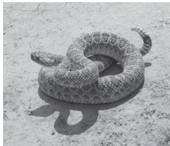
Prairie Rattlesnakes always focus the attention of everyone near them. This example posed just fine for the cameras of many of the field trip participants.