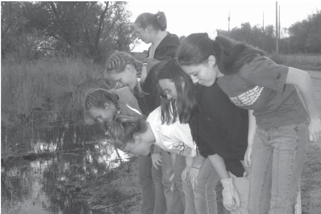
Figure 1. Freshman biology students from Northern Hills Junior High in Topeka heard hundreds of Strecker's Chorus Frogs calling in Harper County and Barber County, Kansas, on the evening of 22 April 2004. Here the group searches a roadside ditch in Harper County south of Anthony near the Oklahoma border.