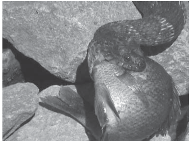
Above: An adult Northern Water Snake ( Nerodia sipedon ) consuming a Sunfish ( Lepomis sp.) at Ottawa State Lake, Kansas.

Submitted by RUSSELL W. LAFORCE , Kansas Department of Wildlife and Parks, 1020 South Kansas Avenue, Topeka, Kansas 66612.