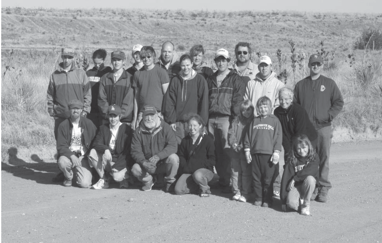
Some of the 29 hardy participants that stayed for the Sunday morning finale of the KHS spring field trip to Logan County, Kansas, on 2 May 2004.

Kansas: Logan Co: Gunnel's Ranch, Sec. 16, T11S, R37W 1 May 2004 (1:00 pm–4:00 pm)