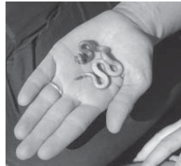
Ringneck Snakes were not nearly as abundant in Logan County as they are in eastern Kansas.