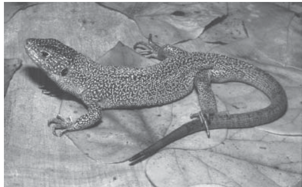
An adult female Western Green Lacerta ( Lacerta bilineata) from the introduced colony in Topeka, Kansas.