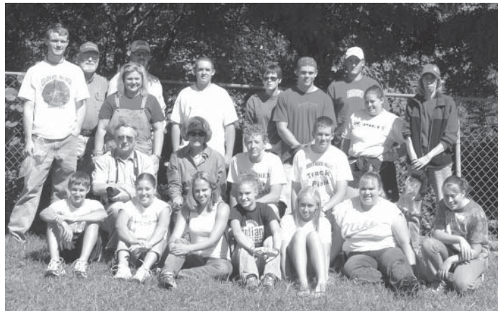
Participants for the 2003 Sixth Annual Running of the Lizards in Topeka, Kansas, on 14 September.