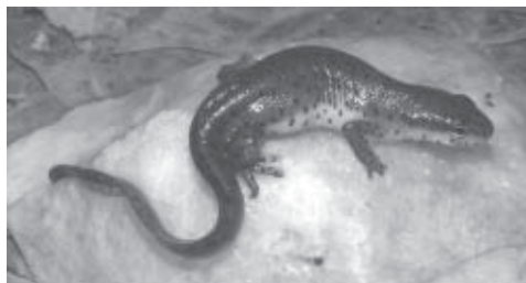
An adult male Eastern Newt from Bourbon County, Kansas.