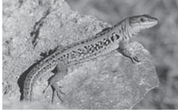
An Italian Wall Lizard ( Podarcis sicula) from the introduced colony in Topeka, Kansas.