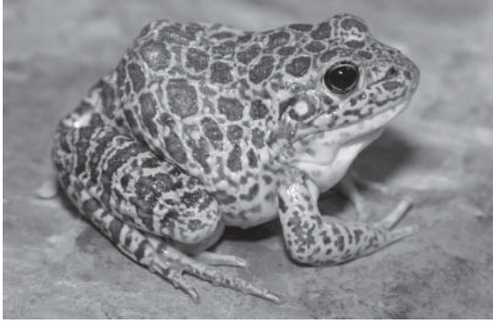
Figure 11. This Crawfish Frog was one of many attractions at the live exhibit.