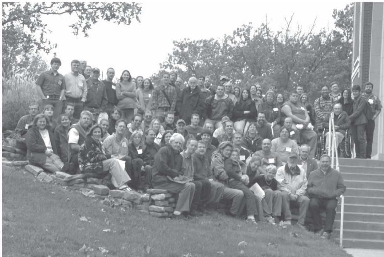
Figure 1. Participants attending the 30th annual meeting of the Kansas Herpetological Society at Emporia State University, Emporia, Kansas, on 8–9 November 2003.